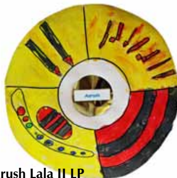
Aarush Lala II LP