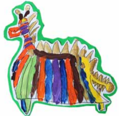
Isabelle de Vree R CF