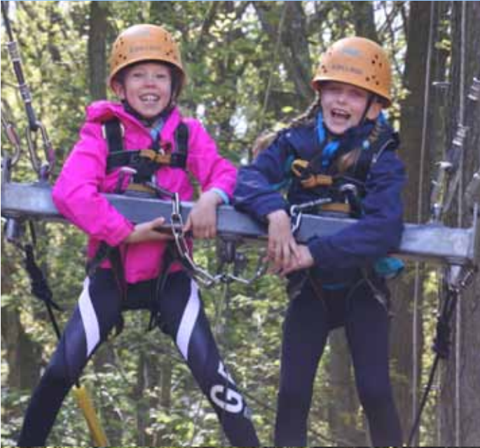
Form-IV at PGL