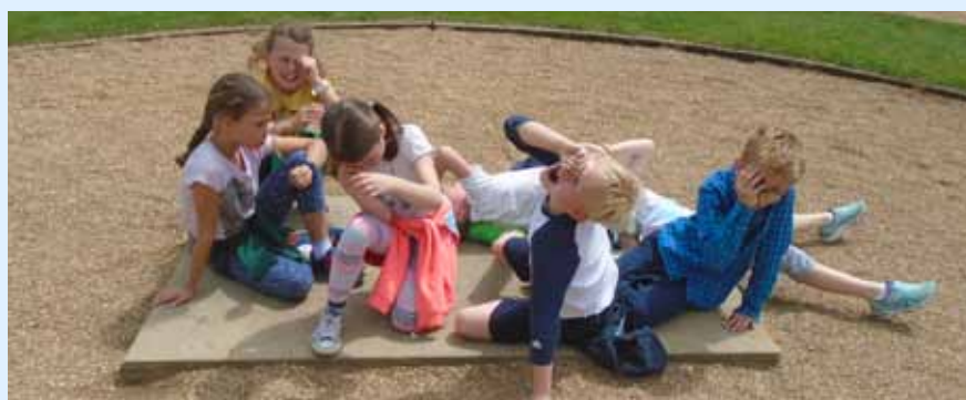
Reenacting King Harold's Death