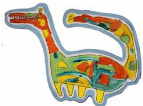
Arabella Shaw R CF