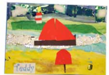
Teddy Wilson I P